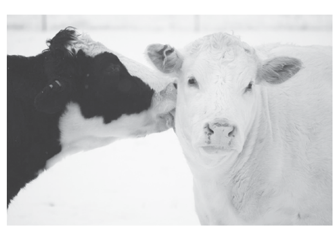
Cookies & Cream have their own holiday card at Sanctuary One.

one, simplify your gift giving, remove some stress from the season and support a local effort that contributes to the unparalleled quality of life here in southern Oregon. And you'll know that the money you invest will continue to work for a great cause long after the holidays are over.